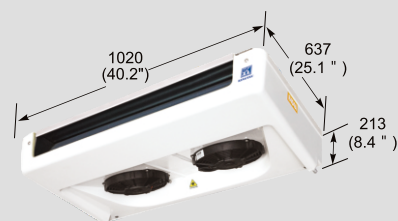
EVK350 Evaporator Assembly