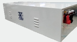
DC48V 400A Battery