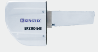
All electric 48V compressor